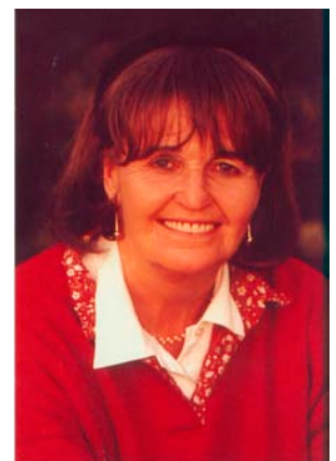
Baroness Caroline Cox of Queensbury, British House of Lords

Karabakh, is a renowned philanthropist and human rights advocate. Her humanitarian work has taken her on many missions to “no-go” conflict zones in Sudan, Nigeria, North Korea, Indonesia, Burma and Nagorno-Karabakh. Visiting Armenia and Nagorno-Karabakh more than sixty times, the Baroness witnessed the people’s suffering during and after the crisis of the Nagorno-Karabakh conflict. This and her other involvements with issues and concerns of the needy around the world have made Baroness Cox a “voice of the voiceless” (continued page 2)