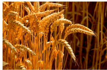
Hope from the “field of dreams”

The Agro Initiative is a three-year, three-region plan to develop the agricultural infrastructure by focusing on region's potential—fertile land, favorable climate and hardworking people. The goal is to upgrade rural standards of living and capacity of the region's people to build their future by increasing rural household income. The latter will allow improvements in the overall health and nutrition of Karabakh people by targeting poverty reduction in the region. This, in turn, will give people a reason to stay and prosper in their homeland instead of emigrating to foreign countries to earn their daily living. Now, this is “sustainable development”.