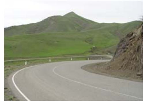
North-South Highway: a landmark project

The construction of the Stepanakert-Karmir Shuka section of the road started in January of 2005 and is due to be completed in October, 2006. This was the heaviest part of the remaining construction. Another section of the road under construction is Drmbon-Stepanakert, a 7.2-mile highway that links surrounding villages and towns to the capital of Stepanakert. A completed section