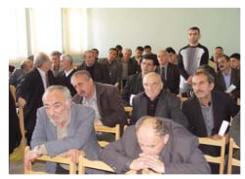
Farmers of Mardakert's cluster of villages assembled to learn more about the Agricultural Initiative

company to provide technical and farm equipment services at affordable fees to farmer members. The Association is an independent voluntary union formed to mutually benefit the participating members in their agricultural production activities.