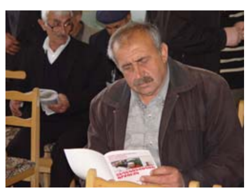
A local farmer reading about how to join the Agricultural Development Association

The Agricultural Initiative, designed to upgrade the agricultural sector of Karabakh's economy, is a crucial factor in the overall socio-economic development plan for the region. It is a three-year agricultural development project that will improve the standard of living of the rural villages of Nagorno-Karabakh by targeting poverty reduction. The project started in the war-torn region of Mardakert and its cluster of villages and is to be continuously carried onto other regions. Hadrut in Nagorno-Karabakh will follow Mardakert's agricultural development project.