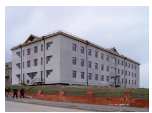
Armine Pagoumian Polyclinic and Diagnostic Center in Stepanakert

Imagine yourself in a remote village in a war-torn region, with a medical condition and no access to a doctor or a healthcare center. Imagine the daily socio-economic hardships the people of Karabakh have to cope with, and the health problems these hardships impose on men, women and children there. From malnourishment to high rates of smoking, from poor diagnosis to impoverishment and inability to afford medical examination— all make up the bigger problem of "underdevelopment." Among so many areas that require intervention and development assistance, providing adequate healthcare center for Stepanakert, center of Nagorno-Karabakh, was one that needed to be addressed immediately.