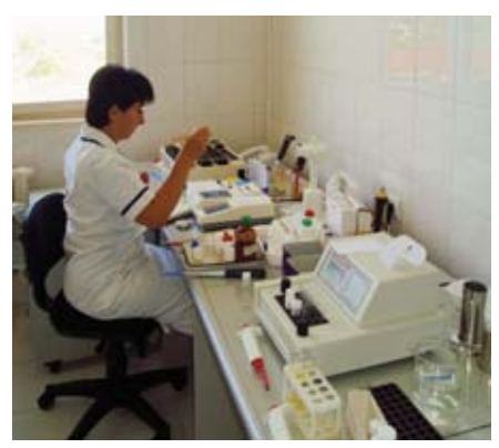
A laboratory at the Armine Pagoumian Polyclinic and Diagnostic Center.

On board for the development and implementation of medical training modules and telemedicine program at Armine Pagoumian Polyclinic and Diagnostic Center is an impressive list of collaborators including UCLA's Center for International Emergency Medicine, Yerevan's Academy of Medicine, the American University of Armenia's Center for Health Services Research and Development, John Hopkins University's Center for Emergency Disaster and Refugee Studies and MediTech Company.