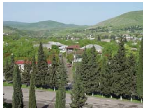
The Rural Development Program will revive the villages of Karabakh through key socio-economic projects

Mardakert region of Nagorno-Karabakh was selected as the initial place to establish the first ADA and ASCO.