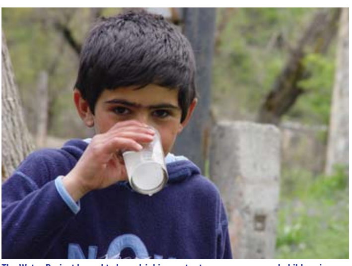
The Water Project brought clean drinking water to women, men and children in Nor Getashen

Armenia Fund USA works closely with like-